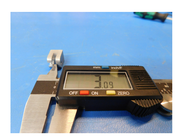
Figure 3: Dimension 16

We will be taking all critical measurements utilizing just a set of calipers as seen in Figure [2].