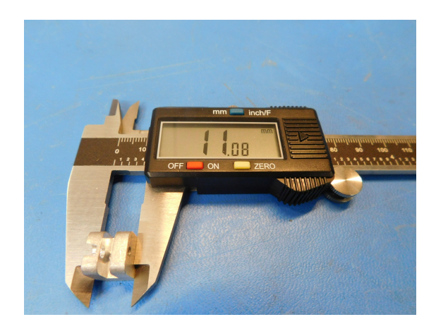
Figure 2: Dimension 15