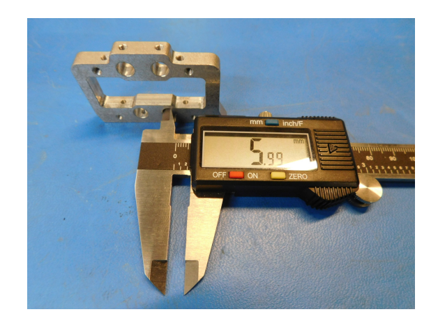
Figure 2: Dimension 42

We will be using a set of calipers to take all measurements for this part. Take note of the failures for dimension 41, I confirmed these were still passing by using a 6.12 pin gauge. Dimension 42 was double checked with a 6.12mm pin gauge when they seemed like they failed. The gauge could not fit into any of them it was deemed passable.