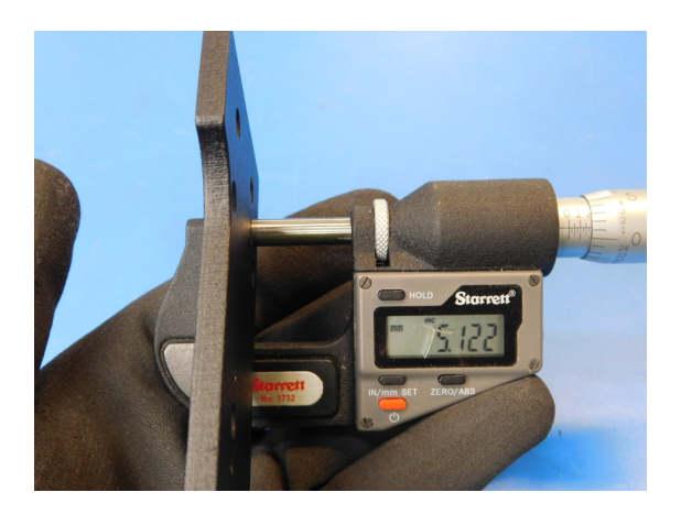
Figure 4: Dimension 09

Using a micrometer we can measure the thickness of the part to check for adherence to written tolerance specifications of 5.0 \pm 0.75mm , resulting in a upper control limit of 5.75mm and a lower control limit of 4.25mm.