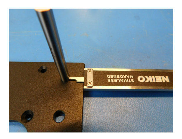
Figure 3: Dimension 04