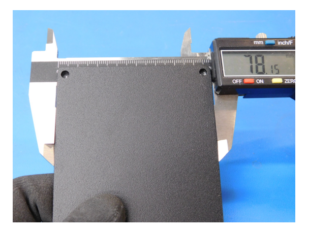
Figure 3: Dimension 03