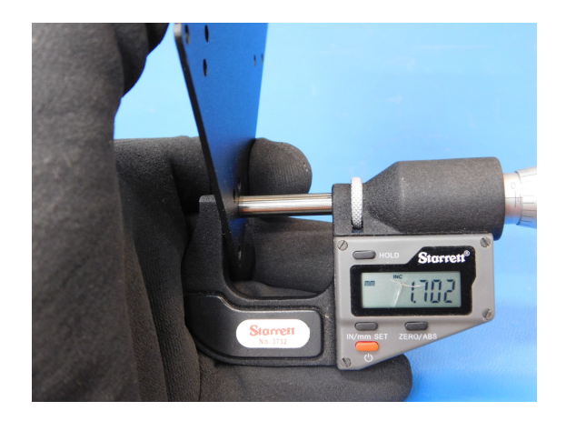
Figure 5: Dimension 05

We use a micrometer to measure the thickness of each part to check if its within tolerance of 1.59 \pm 0.25mm . This results in a upper control limit of 1.34mm and 1.84mm.