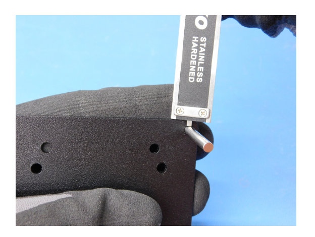
Figure 2: Dimension 01

Using a 3.70mm pin gauge and the back end we can measure each hole from the outside perimeter of the part. The hole is 4mm in diameter, so we should expect the hole to be 2.30 \pm 0.25mm , and this defines the lower control limit to be 2.05mm and a upper control limit of 2.55mm. This measurement will be taken for each outer hole that is similarly spaced around the edge for a total of 10 measurements per part.