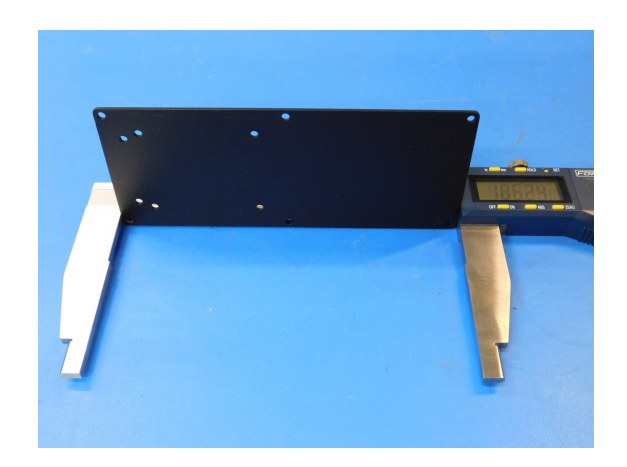
Figure 4: Dimension 04