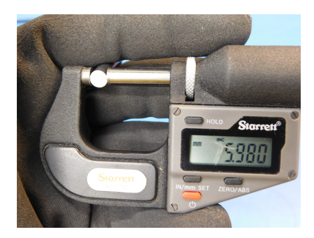
Figure 2: Dimension 01

Use a micrometer to measure the diameter of the rod in order to check tolerance. The rod should measure a radius between 6.00mm, our upper control limit, and 5.97mm, the lower control limit.