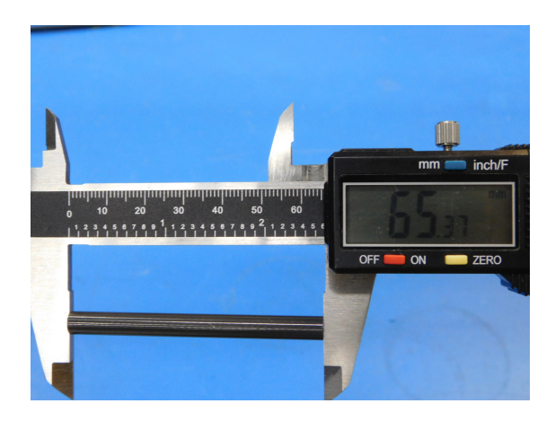
Figure 3: Dimension 02

Use a caliper to determine if the rod is within the tolerance limit of 65.0 \pm 0.75mm . This results in a upper control limit of 65.75mm and a lower control limit of 64.25.