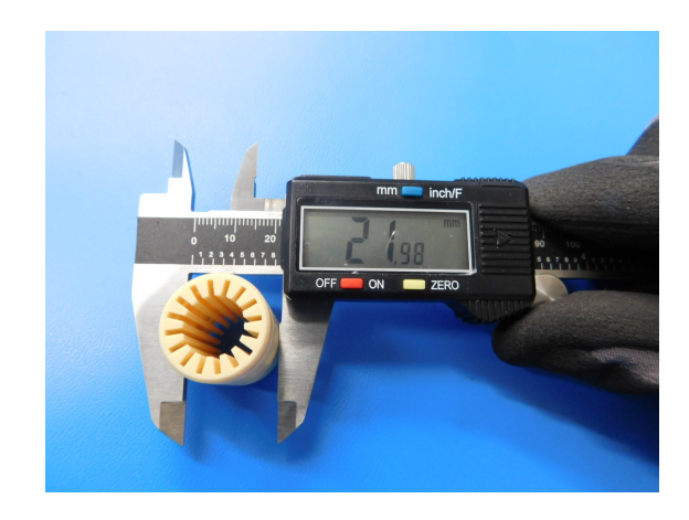
Figure 3: Dimension 02

Using the calipers we can measure the outer diameter of the high precision bushing (D2), as shown in Figure 3, which has an ISO tolerance zone of H7. For the IGUS RJMP-01-12, this will equate to -0.0210mm. This results in a upper control limit of 22.000mm and a lower control limit of 21.979mm