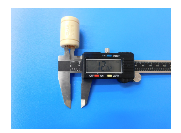
Figure 2: Dimension 01

Using a set of calipers we measure the inner diameter (D1) of the IGUS high precision bushing, the diameter of the interior of the sleeve bearing, which has a tolerance of 12.0(+0.000mm, +.040mm), as shown in Figure 2. This results in a upper control limit of 12.040mm and a lower control limit of 12.000mm.