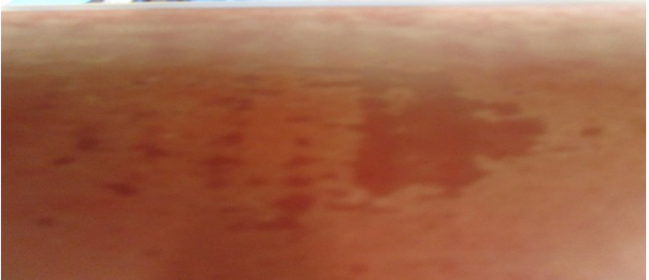
Image showing section of the heat pad that has completely separated from the glass. Reject these