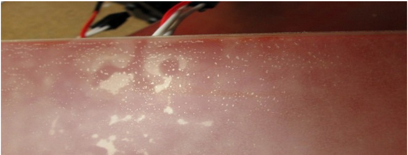
Image 2: acceptable levels of heat pad delamination over the wires. The small amount of interconnecting bubbles is acceptable and normal within 1/4" of the edge of the glass only.