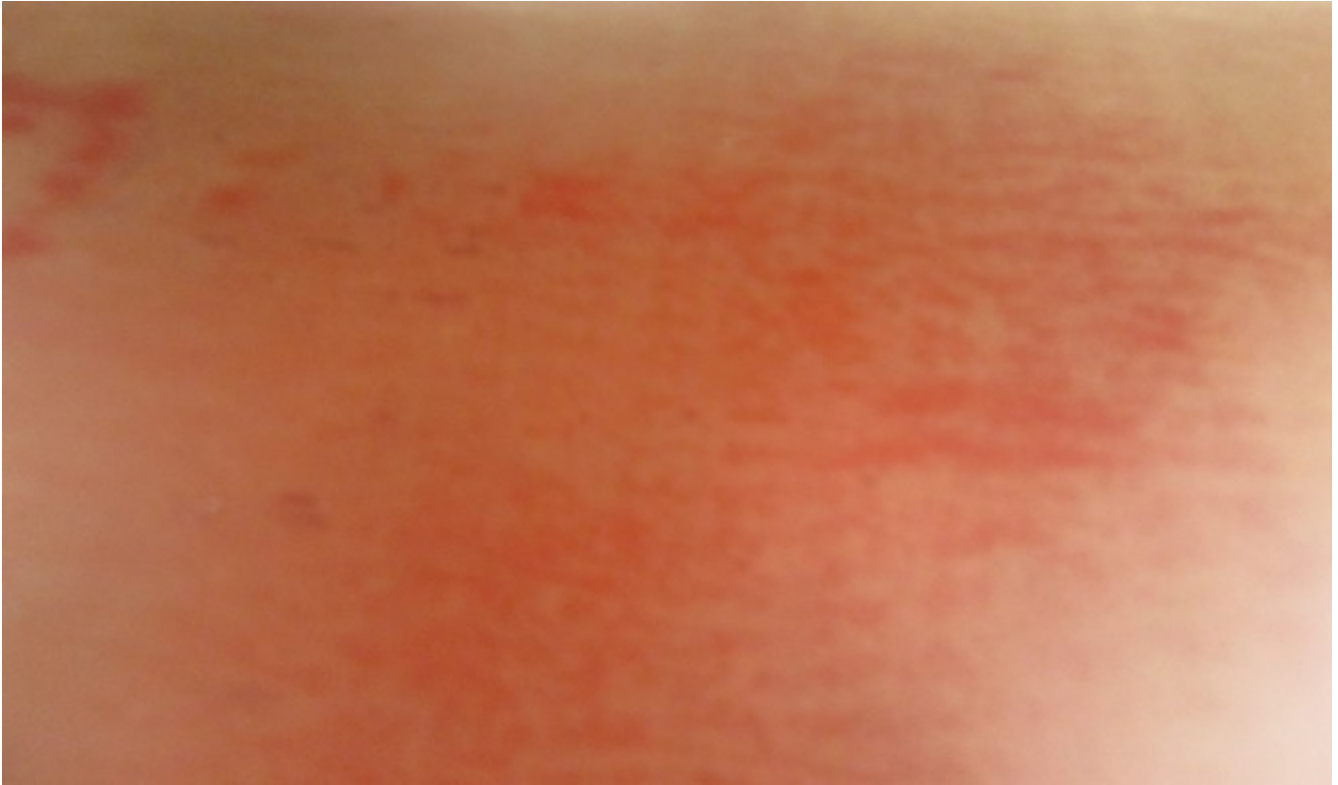
Image showing acceptable discoloration.